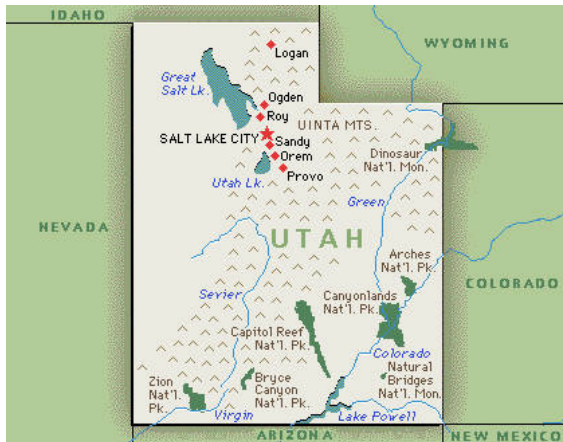
Figure 1. The figure caption should clearly identify what is illustrated in the figure. For example, the location of DSM 2008 is in the city of Logan, which is in northern Utah.